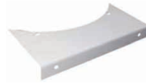
Adaptor square round