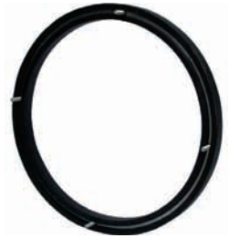
No vibration rings