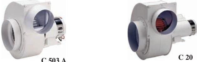
C 503 A