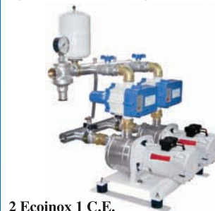
2 Ecoinox 1 C.E.