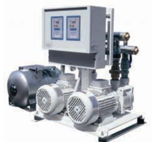
Group ACB 332